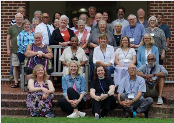
Class of 2022, Roslyn Center, Richmond, VA

The Lay Preacher Training Initiative has partnered with 6 pilot dioceses for a two year curriculum designed by EPF.